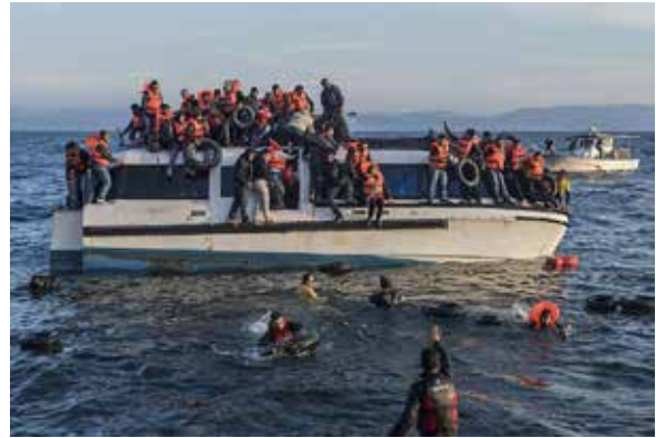
Syrian and Iraq refugees arrive at Skala Sykamias, Lesvos, Greece, 2015.

There were 89.3 million people forcibly displaced world-wide at the end of 2021. Among those were 27.1 million refugees, half under the age of 18 (21.3 million refugees under UNHCR’s mandate, and 5.8 million Palestine refugees under UNRWA’s mandate). There were also 53.2 million internally displaced people, 4.6 million asylum seekers, and 4.4 million Venezuelans displaced abroad. There are also millions of stateless people, who have been denied a nationality and access to basic rights such as education, healthcare, employment, and freedom of movement. (source, United Nations )