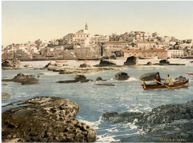
Port of Joppa (Jaffa); image in the public domain